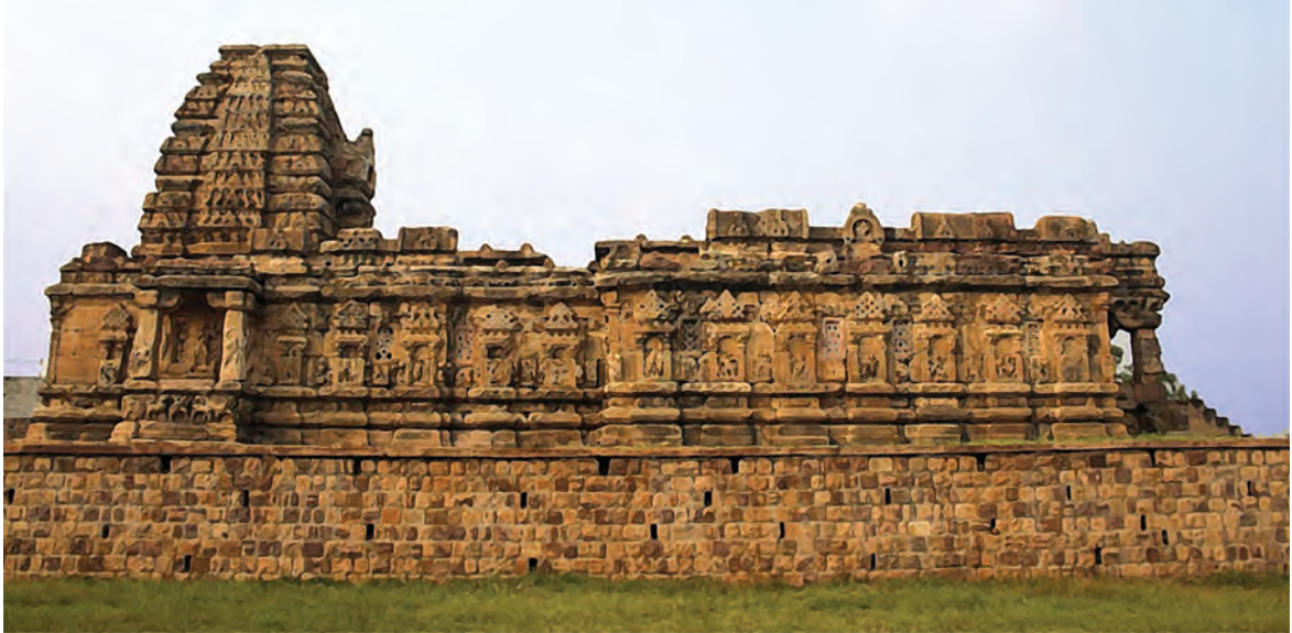
The temple at Pattadakal

the Chalukya dynasty in the sixth century CE. His capital was Badami which was earlier called 'Vatapi'. The Chalukya King Pulakeshi II had successfully repulsed Emperor Harshavardhan's invasion. The famous temples at Badami, Aihole and Pattadakal were built during the Chalukya period.