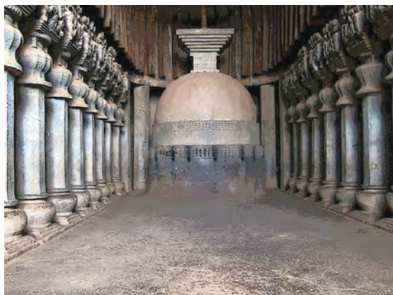
The Chaityagriha at Karla