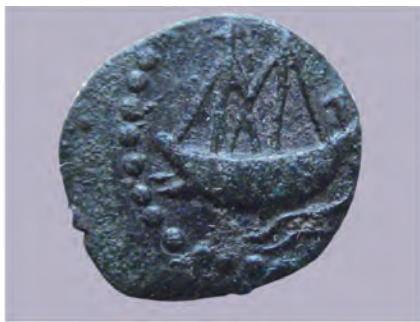
A Satvahana coin with a ship's image

images of ships. The cave sculptures at Ajanta, Nashik, Karla, Bhaje, Kanheri, Junnar in Maharashtra were carved