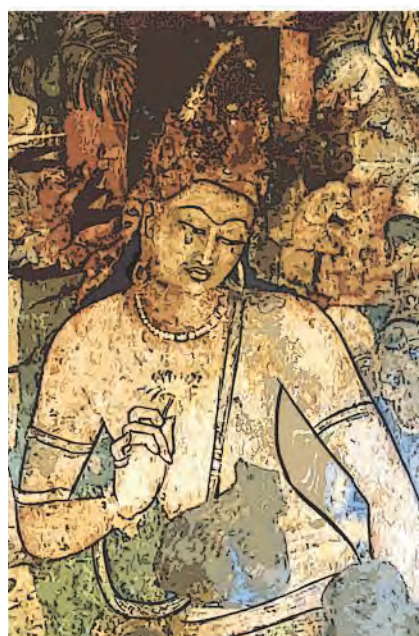
Bodhisattva Padmapani - Ajanta

caves at Ajanta were dug and beautified with paintings during Harishena's reign. The Vakataka king, Pravarsen II, composed 'Setubandh' in Maharashtri, a Prakrit language. Similarly, Kalidasa's 'Meghadoot' also belongs to this period.