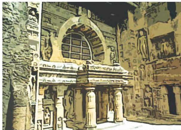
A cave at Ajanta