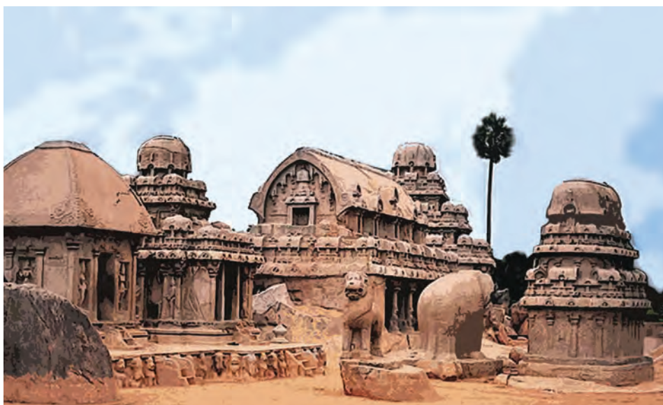
The ratha or chariot temples at Mahabalipuram

The Pallavas were also a powerful dynasty in South India. Kanchipuram in