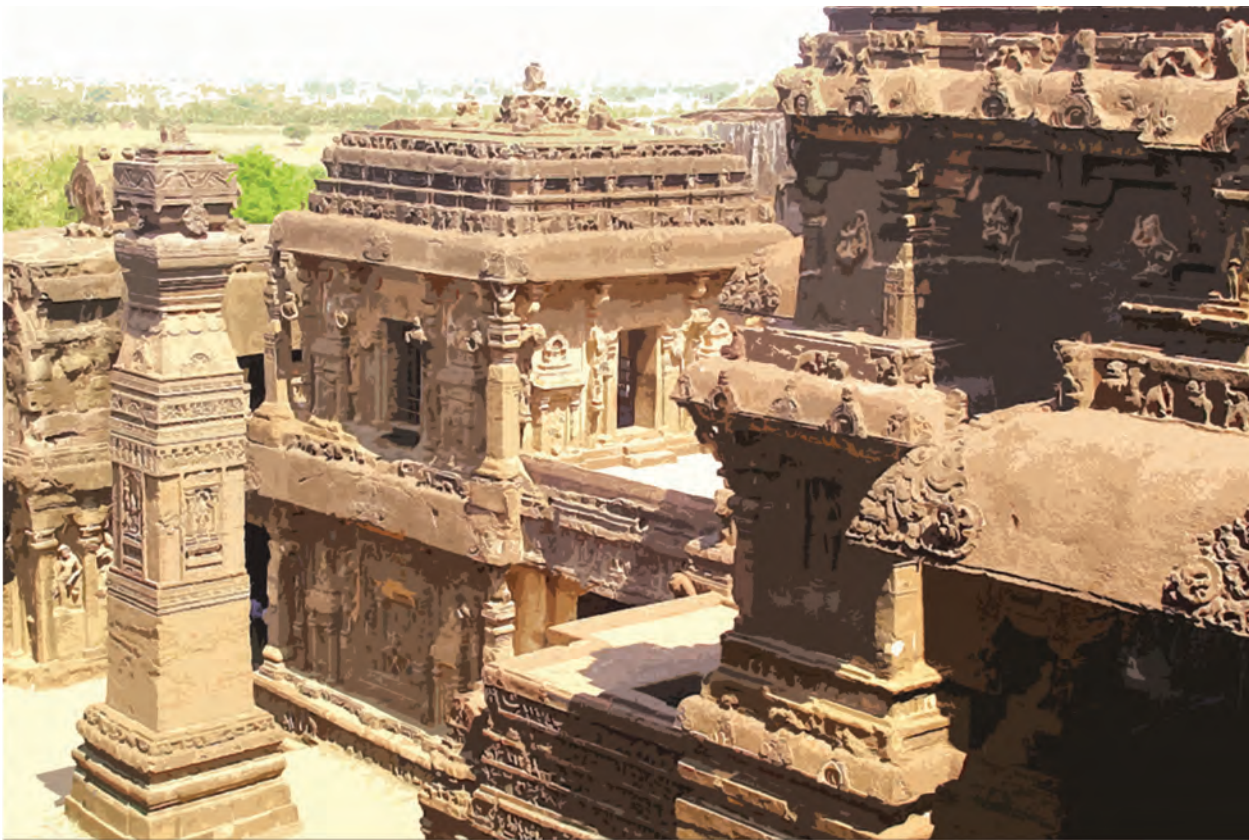
The Kailas Temple at Ellora (Verul)

Up to now, we have learnt about the different dynasties that ruled ancient India. In the next lesson, we will review the social and cultural life in ancient India.